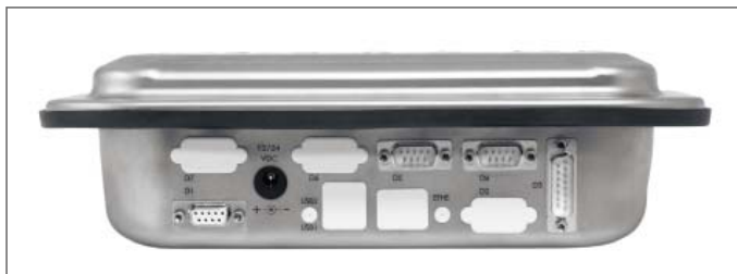
4 D-SUB connectors - IP40