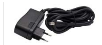
Stabilized power supply included 24 VDC/1 A - 100 ÷ 240 VAC input 3 m cable length